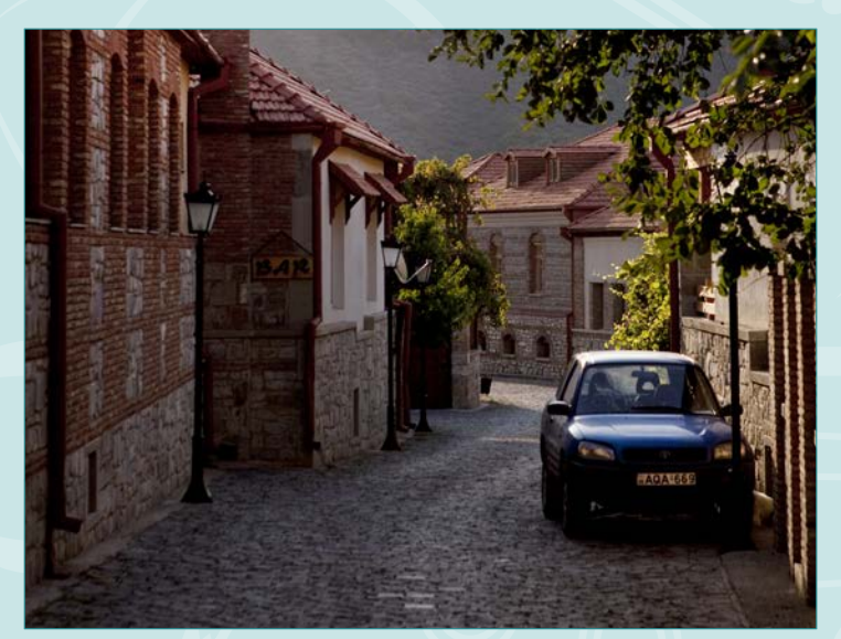
... the ancient town of Mtskheta...