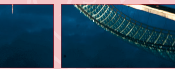
... the stunning Peace Bridge...